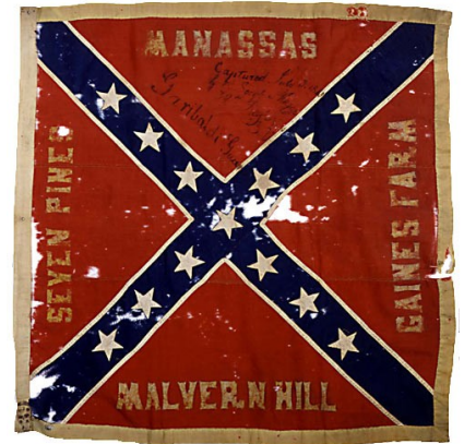
Flag of the 11th Mississippi