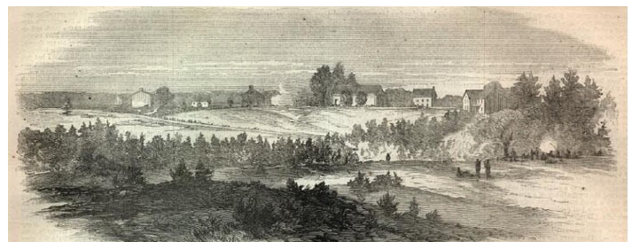
Sketch of Spotsylvania Court House by A. Waud